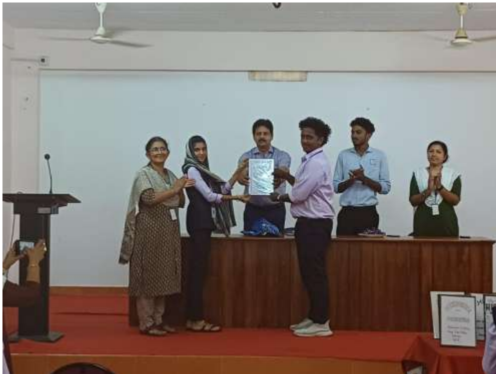
Release of Manuscript Magazine