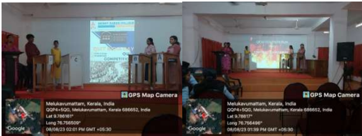
Teams on the stage