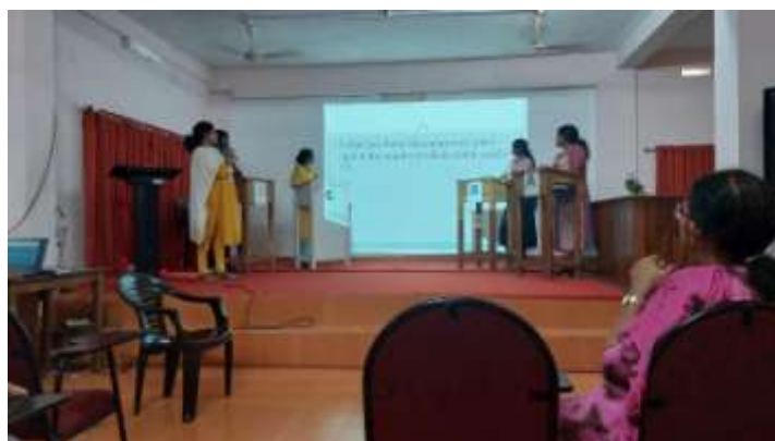
Lakshmi S conducting quiz